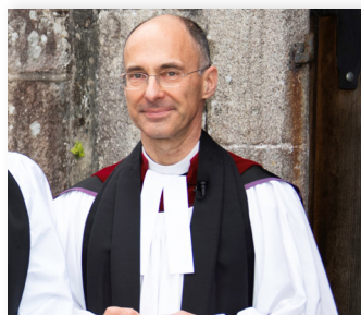
The Venerable Douglas Dettmer, Archdeacon of Totnes