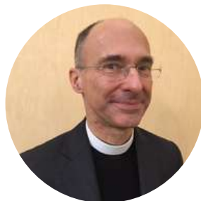
The Archdeacon of Totnes The Venerable Douglas Dettmer