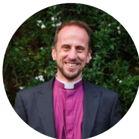
The Bishop of Plymouth The Rt. Rev'd James Grier