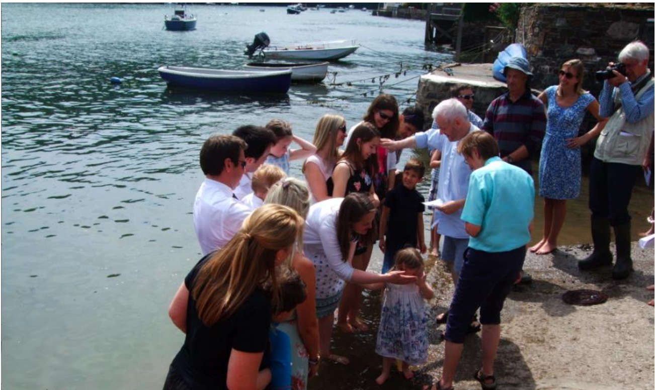
Baptism at Yealm Yacht Club