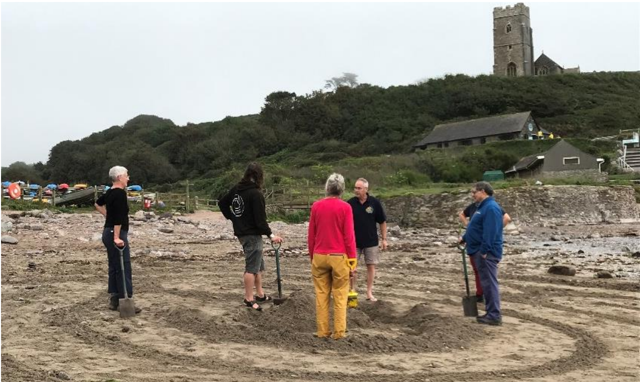
Beach Labyrinth, Wembury

We are now looking for someone who can help us create a distinct identity for the Mission Community, while still respecting the styles of worship that work best for each Parish. This is a very exciting stage in the development of our Mission Community, and the new Team Rector will be ideally placed to play a leading role in that development.