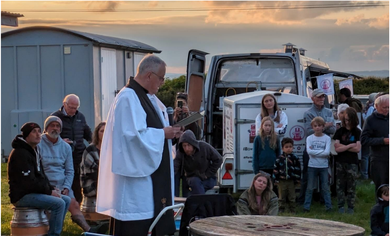
King's Coronation Celebration Service