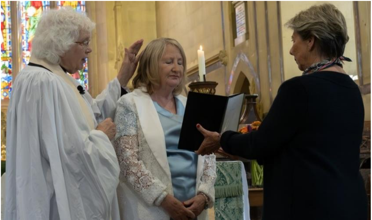
Anna Chaplaincy Commissioning ceremony