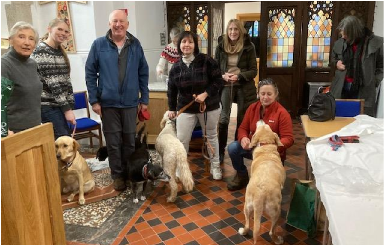
Holy Cross, Newton Ferrers