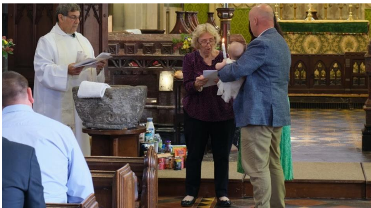
Baptism Service St Bartholomew's, Yealmpton