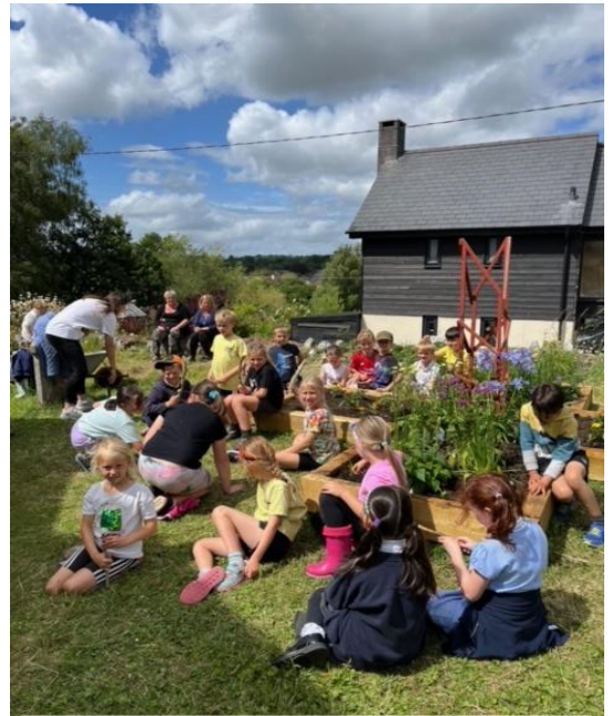
Culmstock Primary school children learning in the churchyard

Our style of worship is liberal catholic.