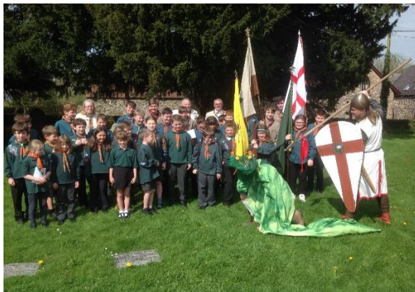
St Georges Day Service

We have a good-sized church room which is used for the charity shop, coffee shop, lunches, meetings, and is available for private hire,