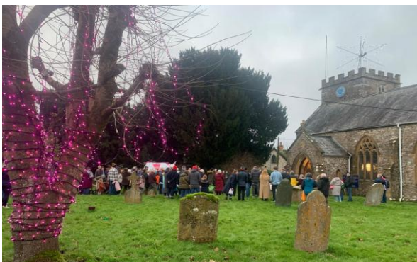
Crib service in the churchyard, December 2024

As shown elsewhere there is a variety of services each month at Hemyock including Holy Communion, Morning Prayer and All-Age services. There is also Café church (held quarterly), Christingle, Crib service and Carols in the Churchyard, Mothering Sunday, Harvest etc. Other services included Remembrance Sunday, St Georges Day Parade and Service run by the uniformed groups.