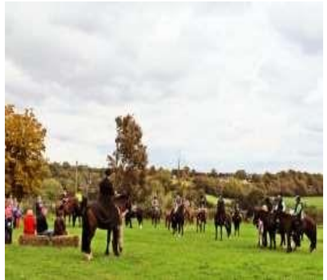
Horse riders service

There are services at Clayhidon on three Sundays a month. A feature of worship here are the regular “special services” which include the annual Riders’ Service (see picture ->) and Plough Sunday Service, plus the Easter morning “Sunrise” service. Our annual Rogation service exercises our right to use the original path to the church through the adjacent “Half Moon” Inn! We also have joint services with the Rosemary Lane Chapel several times each year, which bonds the two Christian communities.