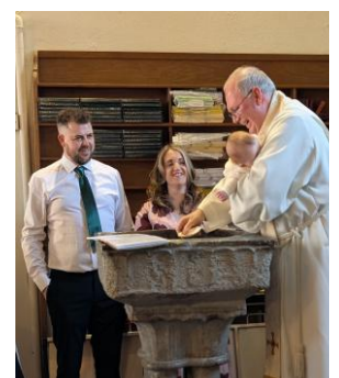
Baptism at St Mary's, 2025