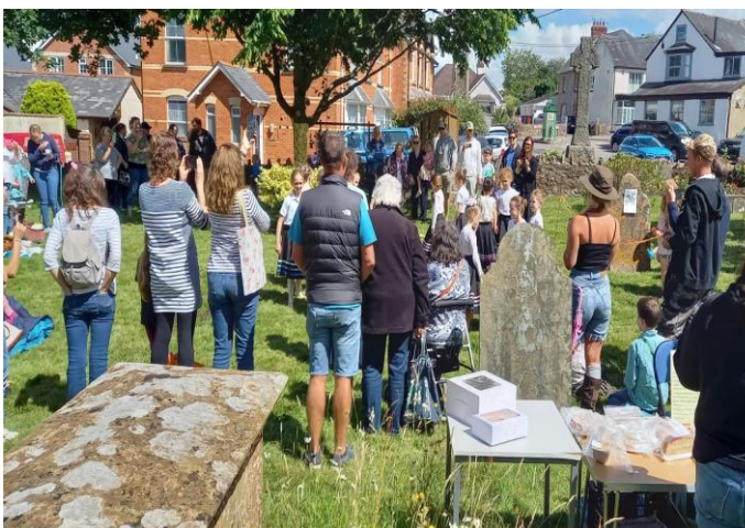
2024 Summer Fete at St Mary's church, Hemyock

There is also the Mary Waldron Education Trust, which is normally chaired by the Rector and provides grants for help with further education for young people in Hemyock and Clayhidon. The trust meets once a month.