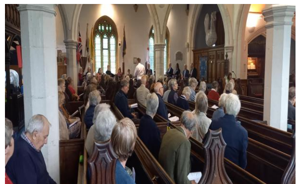
Music Sunday, June 2024