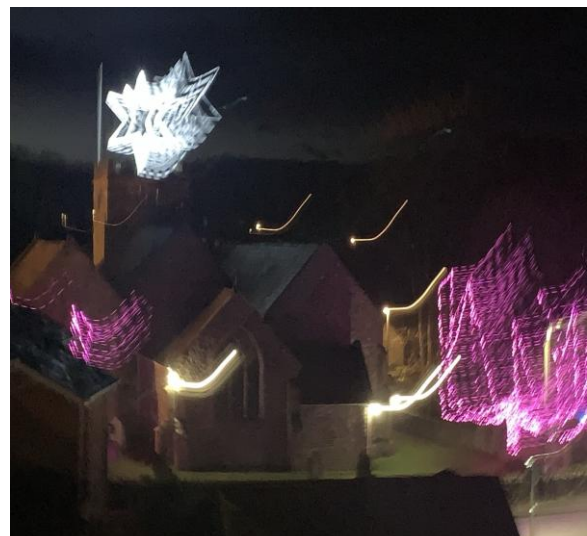
Christmas lights at St Mary’s, Hemyock