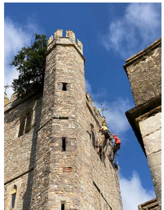
Louvre removal at All Saints church

The tower contains 8 bells which are rung before most mid-morning Sunday Services.