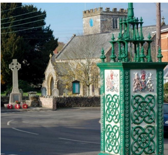
The “Parish Pump” in Hemyock

Services and other activities are currently arranged on a MC-wide basis, with a regular rotation of services in individual churches together with regular whole-MC events including Benefice Holy Communion services. Some people also regularly attend services and events outside their own parish, including meetings for Bible study etc.