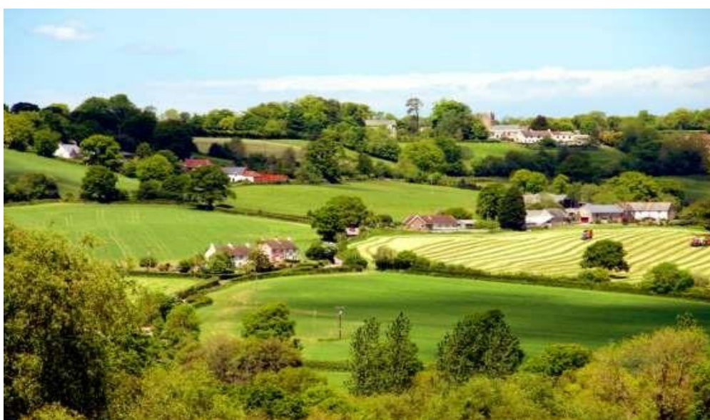
View of part of Clayhidon