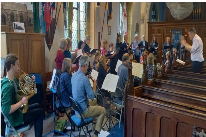
Rehearsal for Music Sunday at St Mary's Hemyock, June 2024

You could be the next Rector of the Upper Culm Valley Mission community!