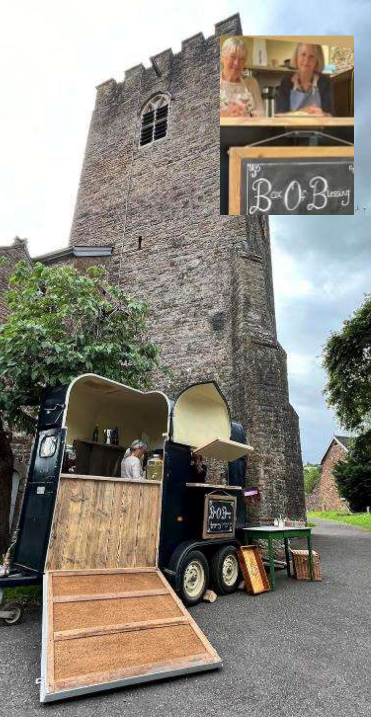
Box of Blessing (Bob) outside Bampton Church