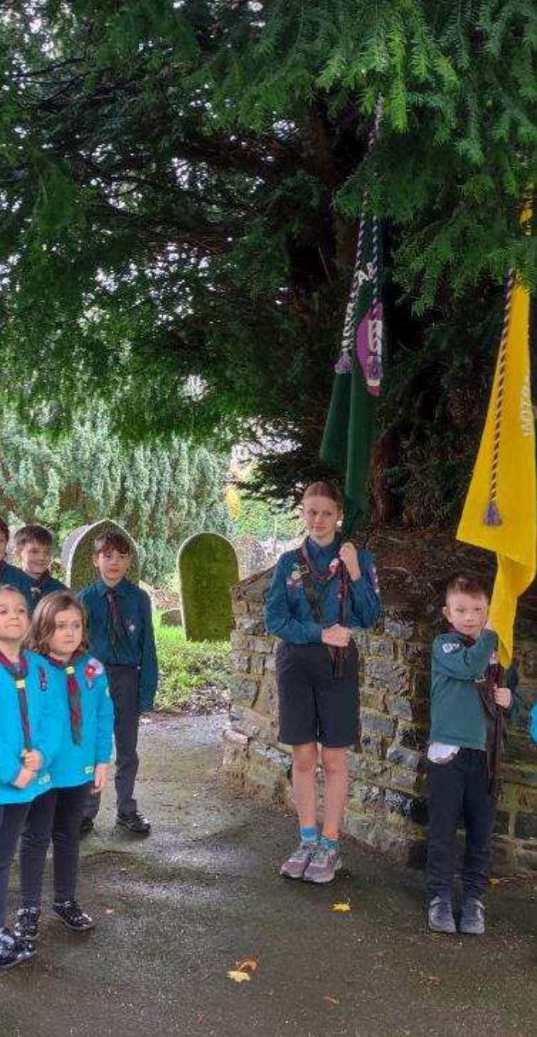
Bampton Scouts on Remembrance Sunday