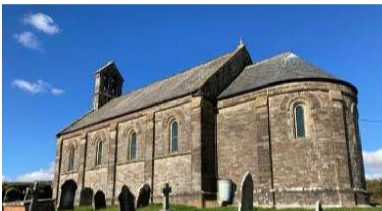
Petton Parish Church

“Being part of a welcoming, caring church family it is great seeing children and younger families joining our celebrations.”