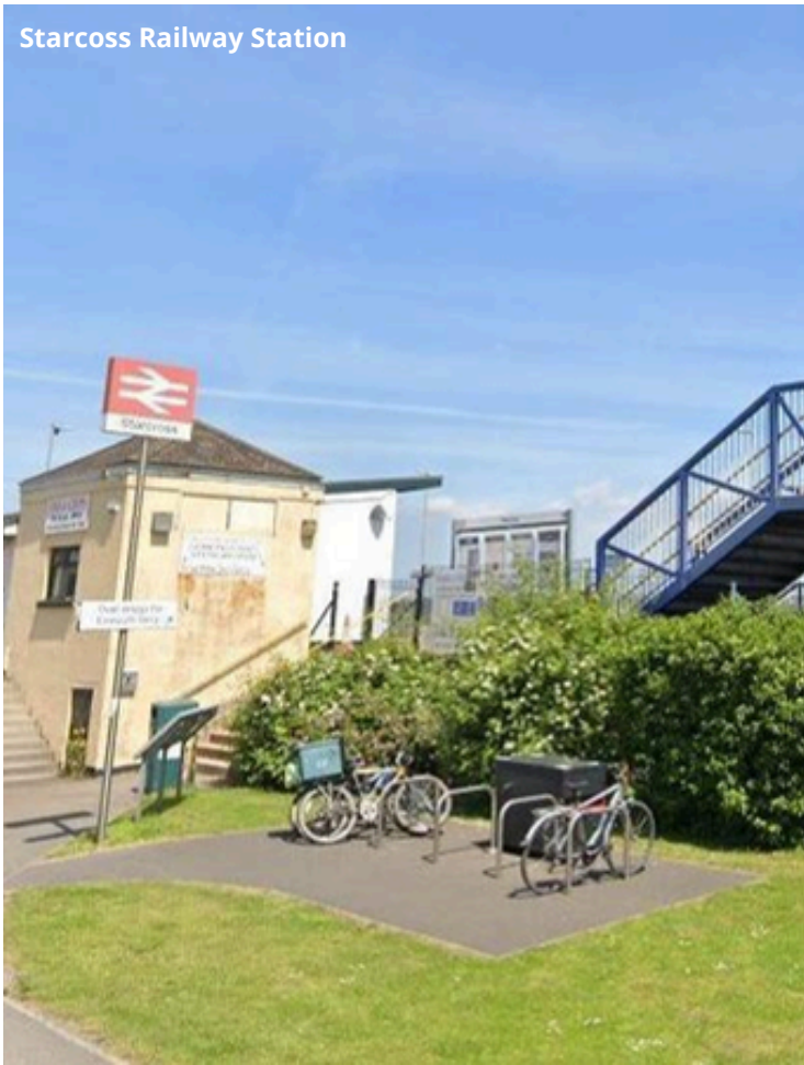
Starcross Railway Station