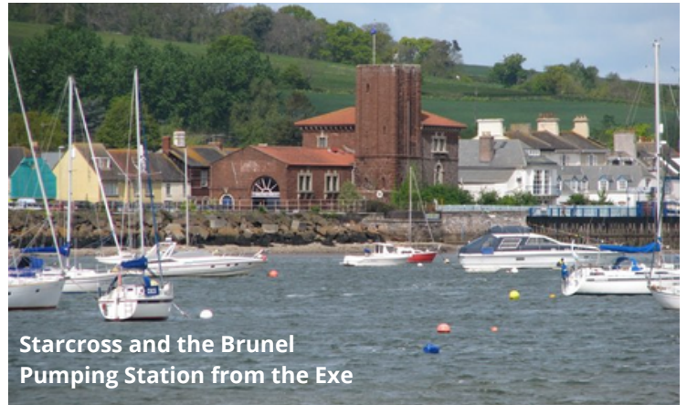
Starcross and the Brunel Pumping Station from the Exe