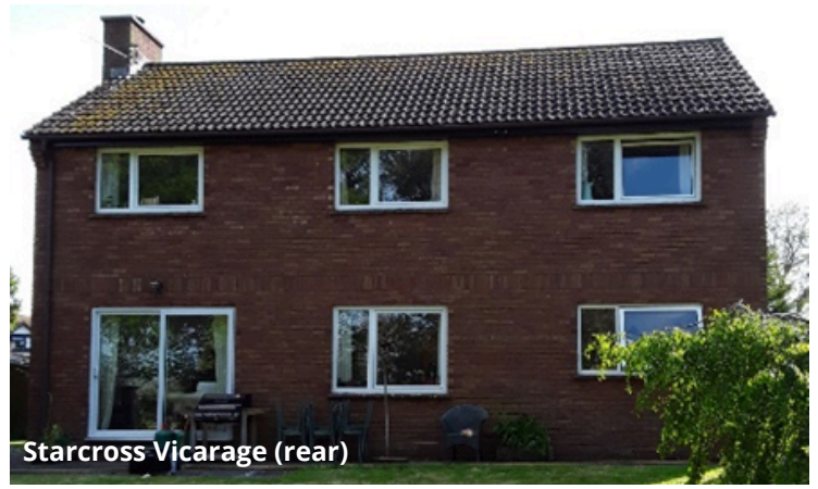
Starcross Vicarage (rear)