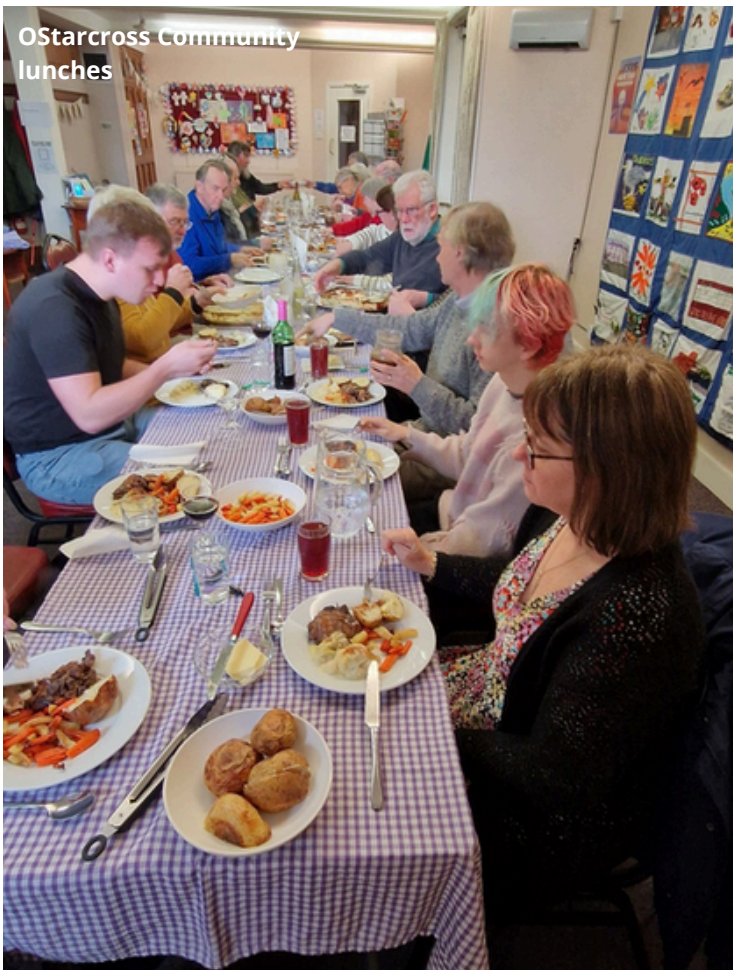
OStarcross Community lunches