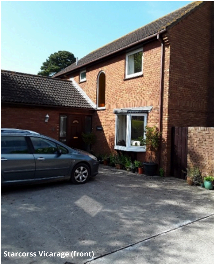
Starcorss Vicarage (front)