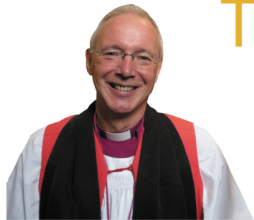
The Right Revd Nick McKinnel Bishop of Plymouth

Sunday by Sunday, a small (but usually willing!) army of volunteers give their time to looking after and teaching the children and young people in our churches. Some run crèches in the back of the church, others lead children out from the service to special activities in the hall, often bringing them back in at the end to show the rest of the congregation a variety of artistic creations.